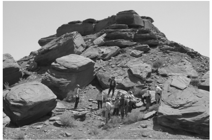
Tour group at Homol’ovi IV.

Moenkopi sandstone and shale. Two locked gates serve as bookends for H-Four, which is open to the public only with special permission.