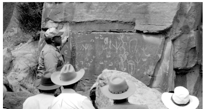
A Dinéah rock panel.

Later, driving down a washboard road to Blanco Canyon, a tributary of Largo Canyon, we found the Blanco star panel with its dancing horned figure, spheres of sun and moon and a knife wing or thunderbird. All the panels we saw were carved or painted on easily eroded sandstone and were re-carved, one image on top of the other. Jim speculated that the Navajo chose these places not only for their directional aspects but also because they held spiritual significance. Perhaps they were created to negate or capture the power of older carvings faintly moving across the surface beneath the newer images. Jim believes that the panels often tell stories, but what they are, he doesn't know. One panel clearly marks out star patterns, the Pleiades and the Big Dipper, but they have not yet been aligned and corroborated with a specific time of year. Images of deities, both horned and feathered, corn plants, animals, circles and men on horseback covered the walls.