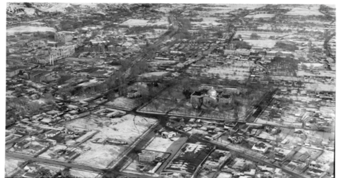
An early aerial view of the neighborhood near the New Mexico State Capitol Building (ca. 1930s). Photo courtesy of Museum of New Mexico Neg. No. 40671.

Since November of 2007, the OAS has intermittently engaged in testing, data recovery and monitoring archaeological efforts west of the New Mexico State Capitol Building in the downtown Santa Fe area. The location will be home to a new parking structure in early 2009. However, in the late nineteenth and early twentieth centuries the area was part of a large multiethnic neighborhood.