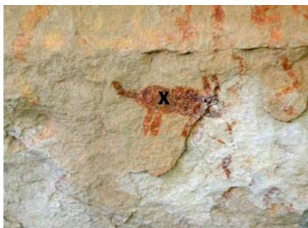
Figure 7. Lost Again Shelter, small red long-tailed animal with pXRF sample point at the X. The iron signal was 20x the background reading of iron in unpainted rock.

anticipate a different age for the deer image from the others.