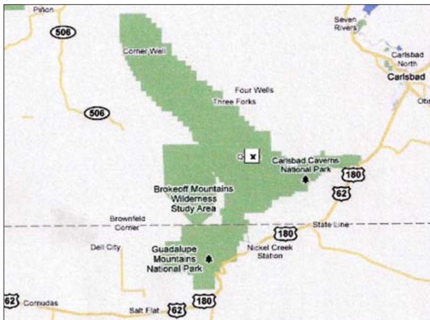
Figure 1. Guadalupe Mountains (green shaded area) on Texas-New Mexico border. Outlined "X" is the location of Lost Again Shelter.

faded art and well-preserved art, with moderate differences in artistic content. Other pictographs are line drawings applied with a brush and / or finger, and these include zigzag lines and tree-like or snake-like abstract art. Dry, ochre pencils were also used to create some geometric images. The variety of techniques and images suggest that the pictographs at Lost Again Shelter were drawn in multiple episodes, potentially over a period of a thousand years. While the pictographs are not always separable by technique or content, most of the fine-line representational art appears to be related to