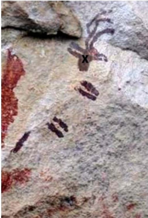
Figure 8. Lost Again Shelter, small red linear deer with pXRF sample point at the X. The iron signal was 30x the background reading of iron in unpainted rock and one of the highest iron readings for elements at the site. Rock art researcher Carolyn Boyd (personal communication 2009) suggested the missing body may once have been white pigment.