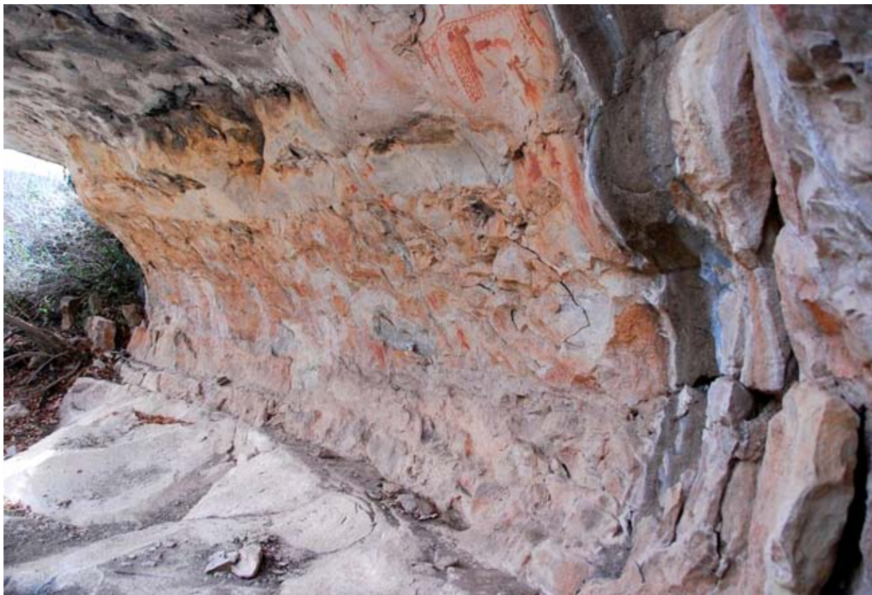
Figure 3. Painted back wall of Lost Again Shelter.

the Guadalupe Red Linear Style (Dillingham and Berrier 2011). The shape of the shelter provides excellent protection to the pictographs (Figure 3). The ceiling overhang extends out a couple of meters and provides good protection from the weather, including direct sunlight and rain. Good preservation of the paintings is expected, and weathering is unlikely to be the cause of the observed low iron signal for so many of the pictographs at this site.