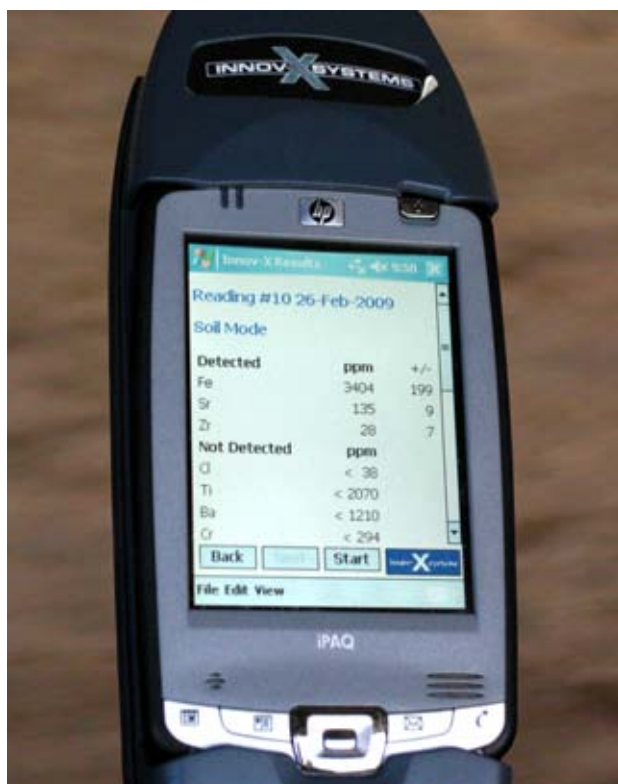
Figure 5. Display of the pXRF device during measurement. The iron signal is quite low for red pigment, only about 1.5 times the background level in the rock, although concentration levels must be considered.