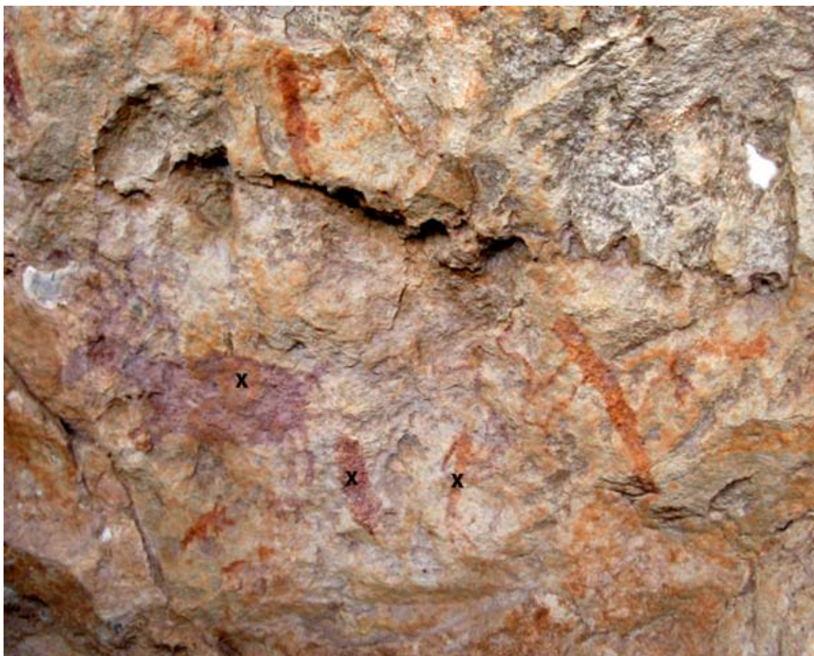
Figure 6. Lost Again Shelter, small red figures with pXRF sample points marked with X. These elements have an iron signal of less than 4x the background reading of iron in unpainted rock.