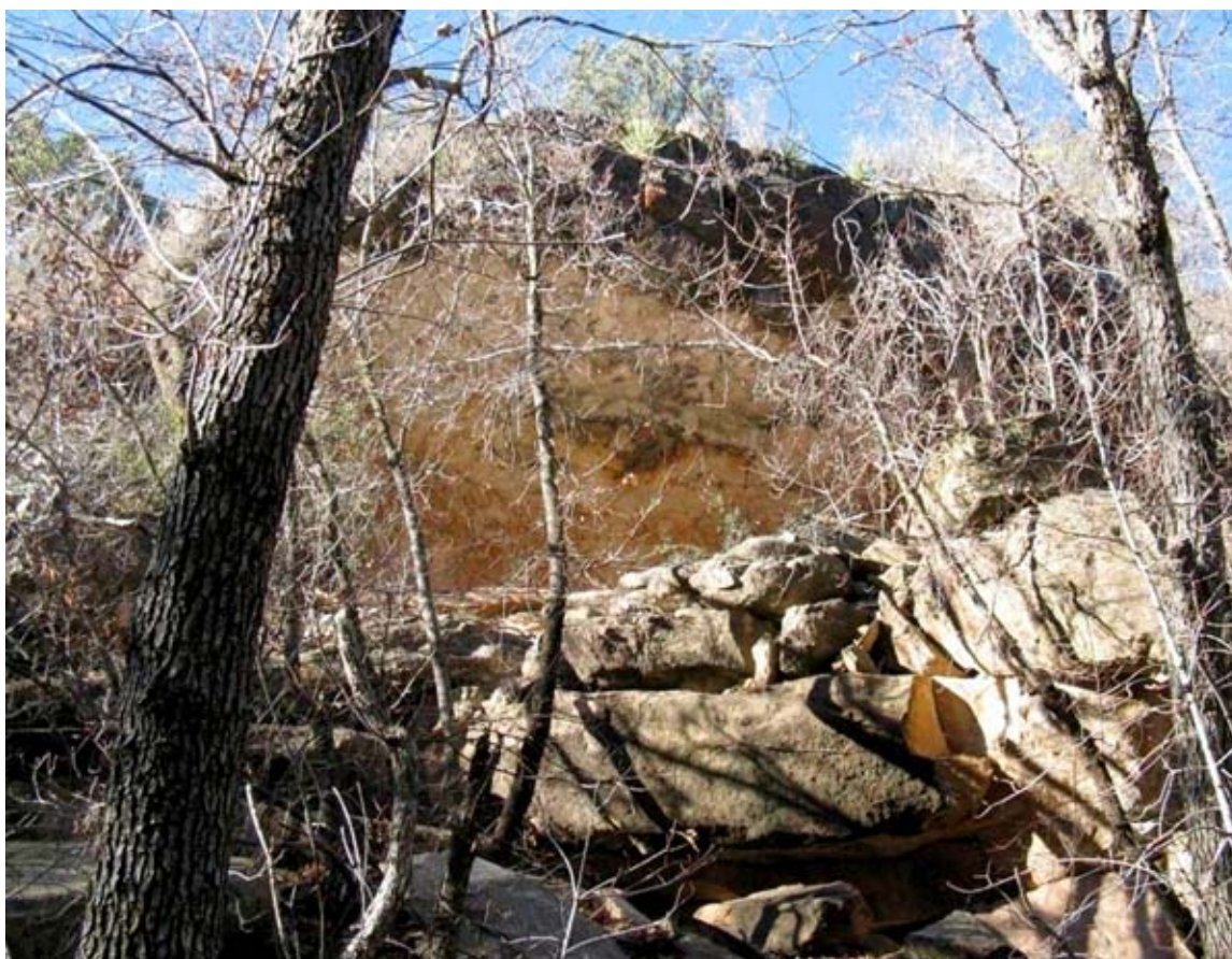
Figure 2. Looking through the trees toward the painted interior wall and ceiling of Lost Again Shelter.

faded art and well-preserved art, with moderate differences in artistic content. Other pictographs are line drawings applied with a brush and / or finger, and these include zigzag lines and tree-like or snake-like abstract art. Dry, ochre pencils were also used to create some geometric images. The variety of techniques and images suggest that the pictographs at Lost Again Shelter were drawn in multiple episodes, potentially over a period of a thousand years. While the pictographs are not always separable by technique or content, most of the fine-line representational art appears to be related to