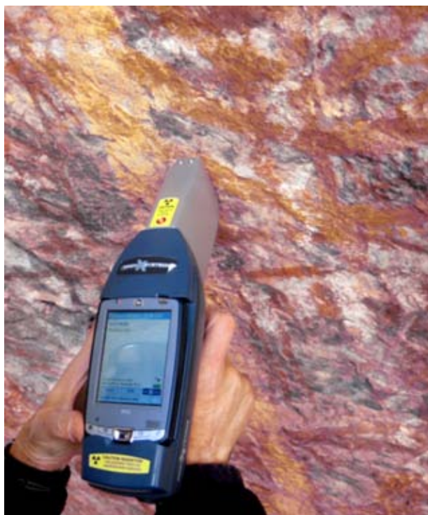
Figure 4. Using portable pXRF device to analyze brownish-yellow paint in Painted Grotto, several kilometers to the southeast. The iron signal here was about six times higher than the reading in Figure 5.

The iron signal shown on the read-out screen in Figure 5 is quite low for a pictograph with red (iron ochre) pigment. The Guadalupe Red Linear pictographs, and in fact many other pictographs at the Lost Again Shelter, had very low iron signals, much lower than ordinarily seen in red and yellow pigments at other sites. For comparison, to demonstrate how low the iron signals are at Lost Again Shelter, the median iron signal is only twice the background iron signal. It must be emphasized that the units are not meaningful and are for rough, relative comparisons at best. In contrast, the median iron signal of all measurements we made at the Painted Grotto site, another painted rockshelter to the southeast, still within the Guadalupe Mountains, is seven times higher, at 15 times the background iron signal (Robert Mark, Marvin Rowe, and Evelyn Billo, unpublished data 2009).