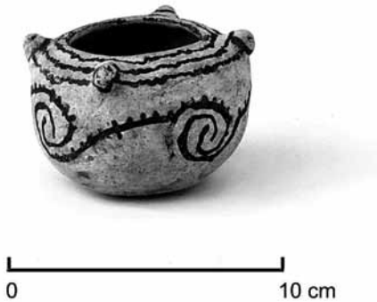
Red Mesa from LA 391 (PojoaqueProject).

Identifying Red Mesa Black-on-white from assemblages in these various regions is like finding an old friend in a crowd of strangers, and its presence hints to widespread movements of and influences between different Pueblo groups at a scale that does not seem to be represented during any other time-period. In these various regions, Red Mesa Black-on-white appears to have developed into white wares commonly associated with different regional local traditions. In the Northern Jornada Mogol-