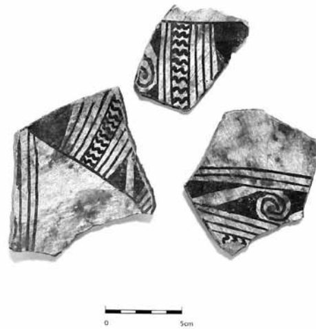
Red Mesa Black-on-white from Taylor Draw, Chupadero Mesa

tery types; each time trying to better understand the nature and significance of the patterns we think we see, and from there devising better methods and strategies to use on the next ceramic assemblage we are granted the privilege to study. ❖